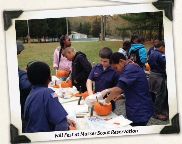
Fall Fest at Musser Scout Reservation