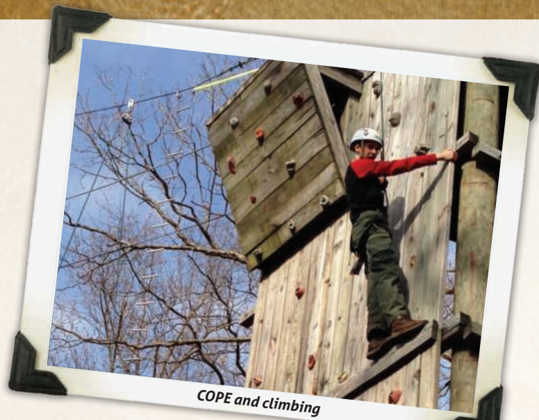
COPE and climbing