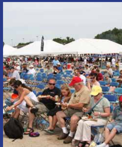
Exclusive seats on the flight line