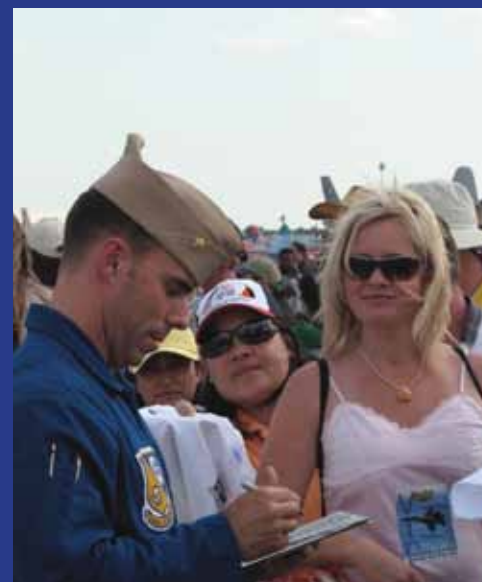
Get up close with air show performers